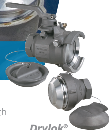
Drylok® Dry Disconnect Coupler