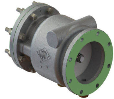
CVS120 3D Model Shown

Since the arm can no longer be drained by just opening the coupler, 2 drain bosses have been incorporated into the valve. One on the API side of the poppet, to allow product to be drained from the outlet side of the CVS120, for removal and servicing of the API coupler. The second is on the loading arm side of the poppet to allow sampling or complete draining of the loading arm for servicing and repair of up stream components like the outboard swivel and hose.