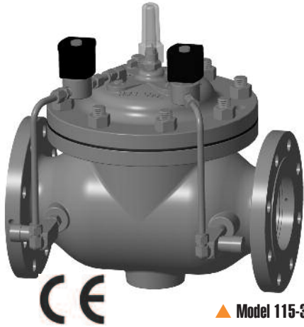
▲ Model 115-3

The Model 115-3 has a wide range of applications: anywhere it may be required to position a valve electrically.